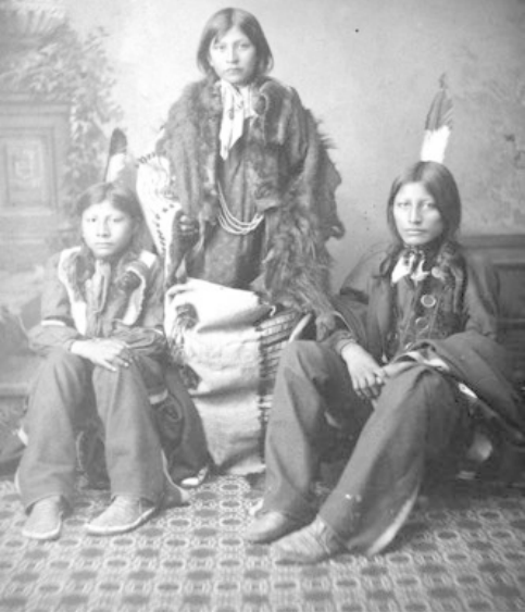
Three Lakota boys on their arrival at the Carlisle Indian School.

Source: Smithsonian Institution, National Anthropological Archives [Choate #125].